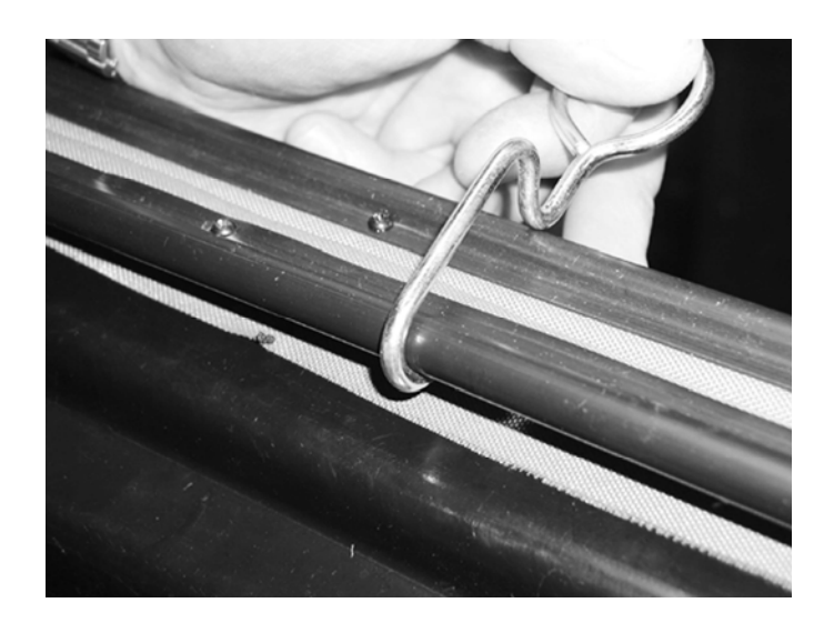
Notice!! - The Tow Rope of this unit is intended for walking use only. Any damage incurred from pulling behind a motorized vehicle is not covered under warranty.